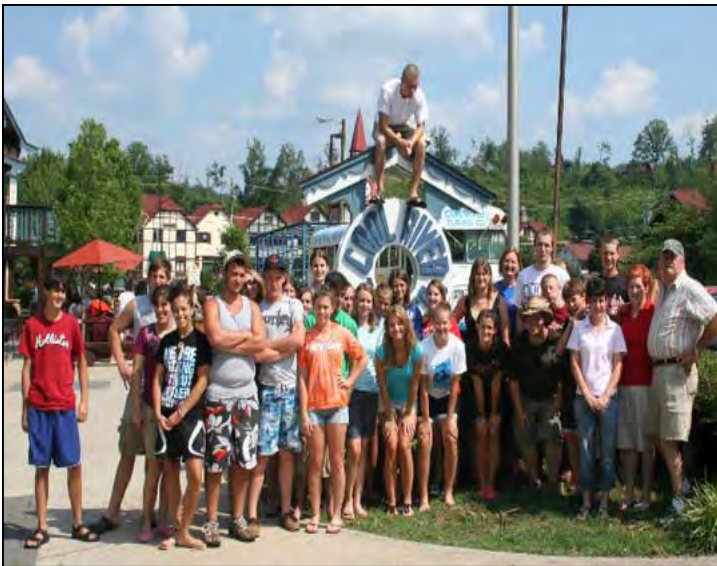
Cool River Fun

Our final meeting for mission trip preparation will be on July 18 th at 3:00pm. All mission team members should bring their basic tool kit as listed in the ASP packet for check off.