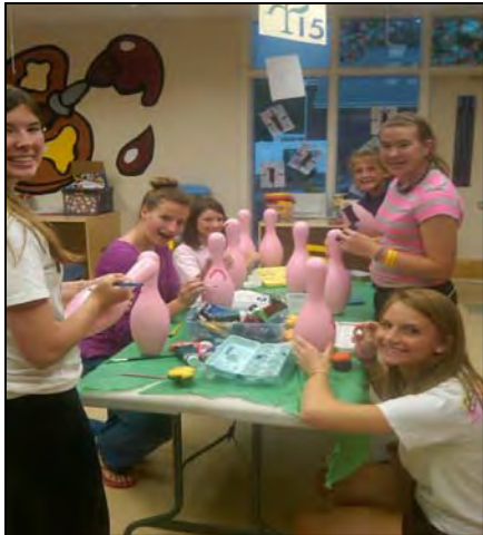
Decorating bowling pins for the Relay for Life event!

During the month of May, we will have a short lesson and use the remainder of the time to work on preparing and planning Graduate Recognition Sunday being held on May 23rd. The Youth will be leading the entire 11:00 service so bring all of your ideas!